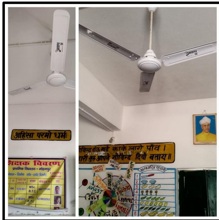
Pic 4: Fans installed in the classrooms of PS, Mohanpur donated by Pragarth

So, in order to provide a relief from the rising temperatures, Pragarth donated two ceiling fans i.e., one ceiling fan for each classroom to the Primary School, Mohanpur .