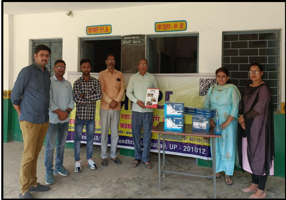
Pic. 21: Team Pragarth donating Ceiling fans to Composite School, Karanpur Gawri

So, in order to provide a relief from the rising temperatures, Pragarth donated two ceiling fans i.e., one ceiling fan for each classroom to the Composite School, Karanpur Ganwri .