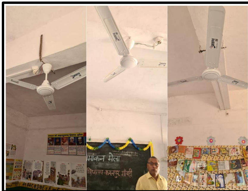
Pic 22: Fans installed in the classrooms of Composite School, Karanpur Gawri donated by Pragarth

So, in order to provide a relief from the rising temperatures, Pragarth donated two ceiling fans i.e., one ceiling fan for each classroom to the Composite School, Karanpur Ganwri .