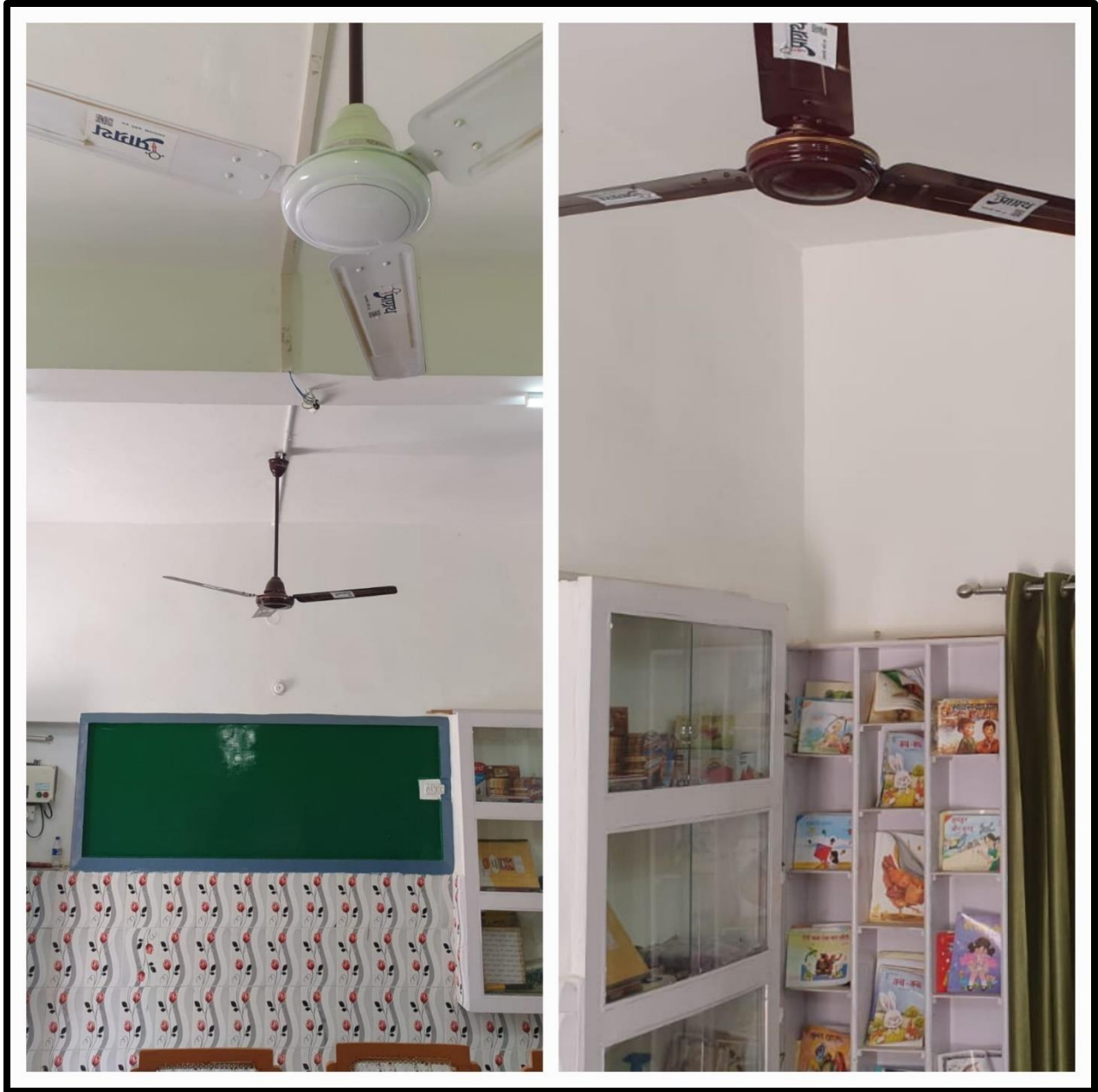
Pic 13: Fans installed in the classrooms of PS; Kazishora donated by Pragrath