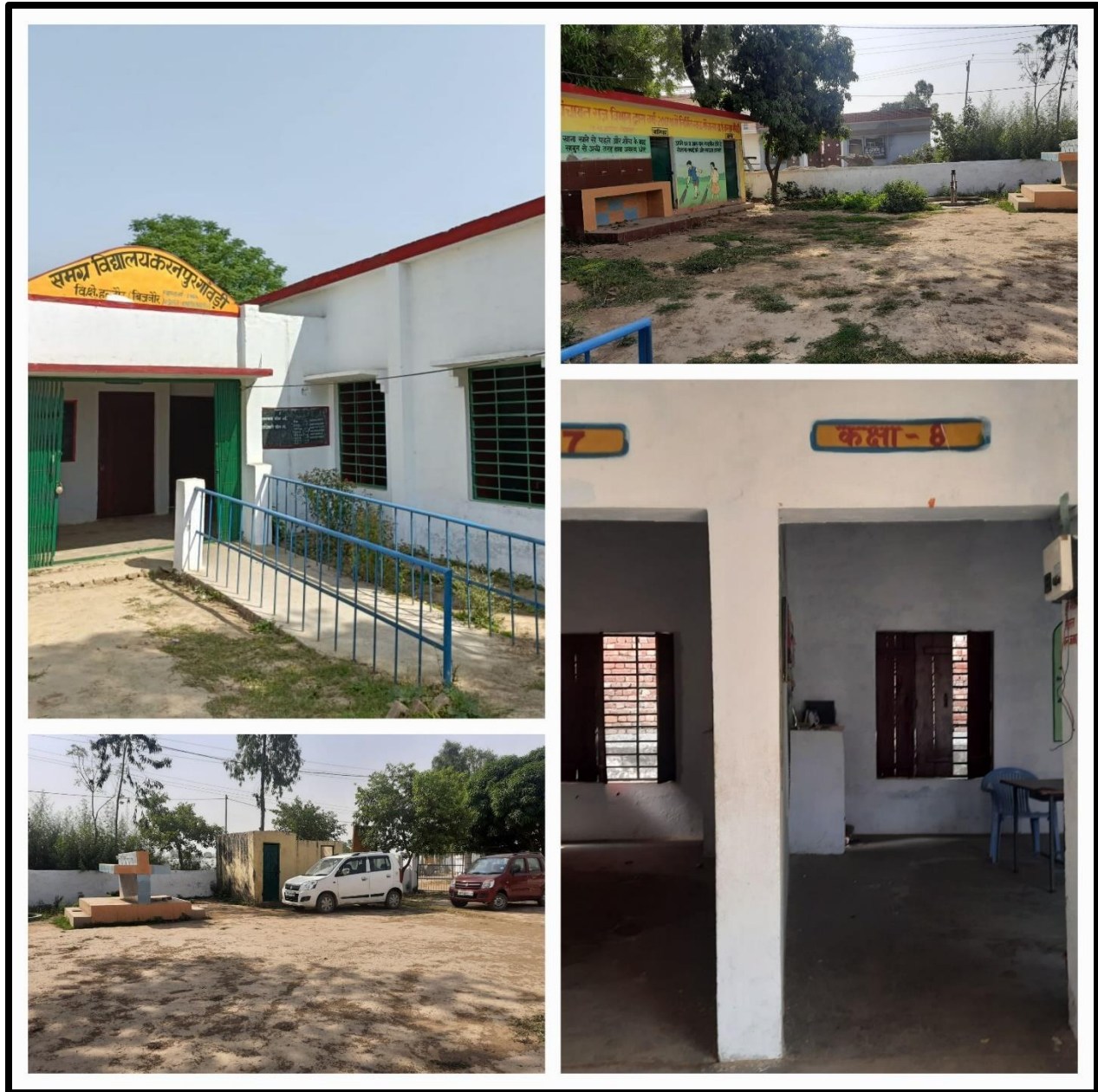
Pic 20: Composite School, Karanpur Gawri, Block Haldaur, District Bijnor, UP

Classrooms were well equipped with teaching learning materials to provide a better teaching learning environment to students for their better future. Although each classroom has ceiling fan but as per the norms and a better ventilation, the classrooms require two fans.