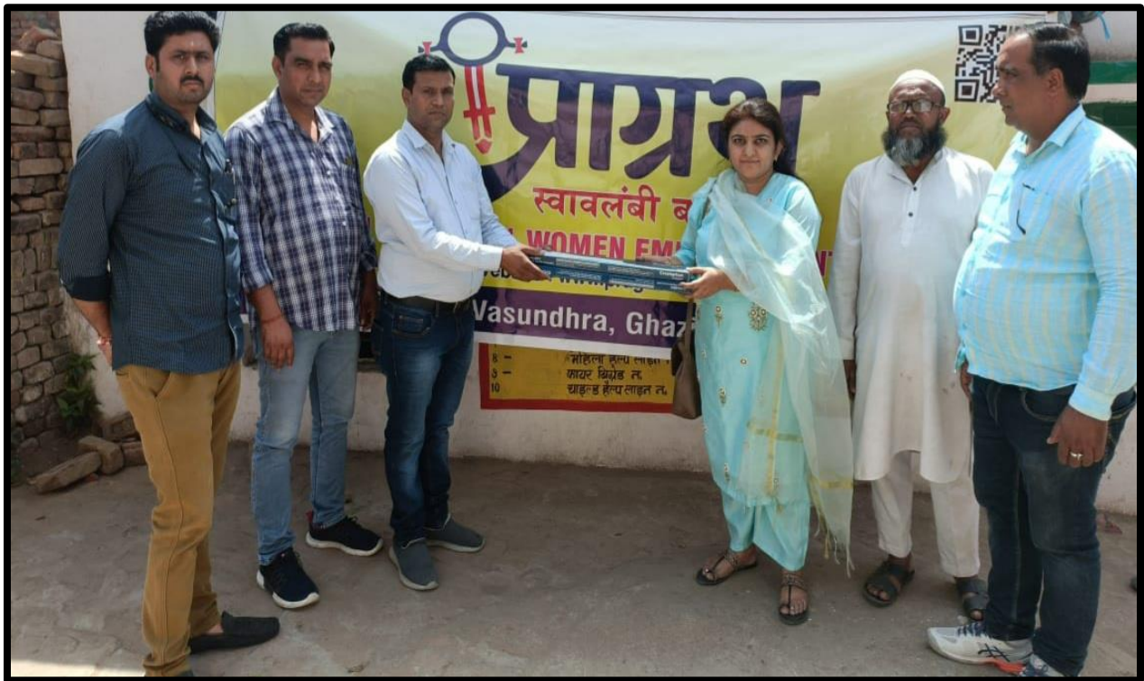
Pic. 5: Team Pragarth donating Ceiling fans to PS, Umri Peer

Also, there was the problem of less space to accommodate such a large number of students in a single classroom in hot summers, hanging one more fan could provide some relief to the students and teachers as well.