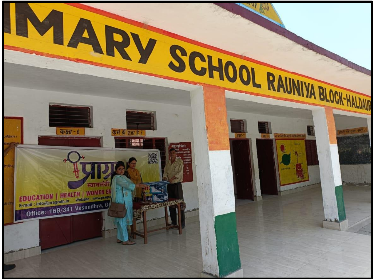
Pic. 15: Team Pragathi donating Ceiling fans to UPS, Rauniya

So, in order to provide a relief from the rising temperatures, Pragathi donated two ceiling fans i.e., one ceiling fan for each classroom to the Upper Primary School, Rauniya .