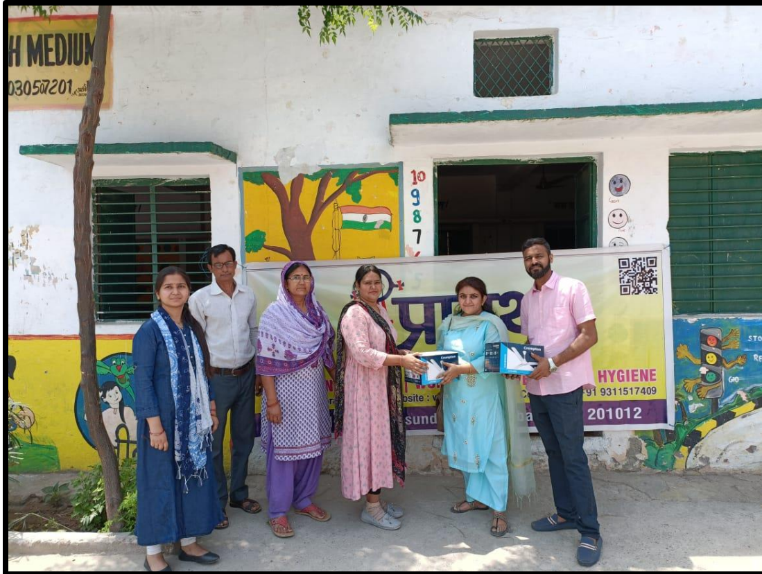
Pic. 9: Team Pragarth donating Ceiling fans to PS, Rauniya

So, in order to provide a relief from the rising temperatures, Pragarth donated two ceiling fans i.e., one ceiling fan for each classroom to the Primary School, Rauniya .