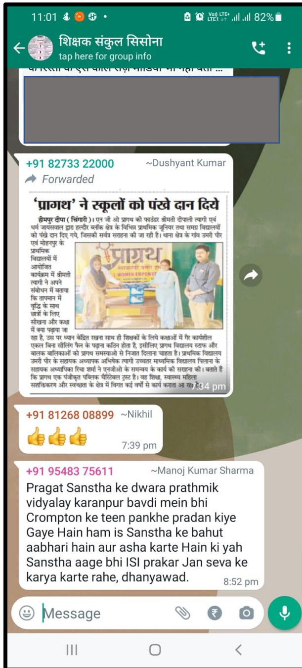
Pic 24: Screenshot of WhatsApp group Shikshak Sankul Sisauna