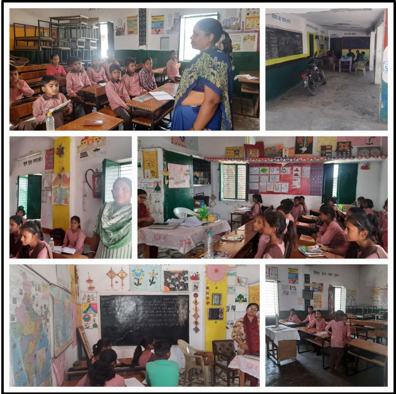
Pic 17: Composite School, Sisauna, Block Haldaur, District Bijnor, UP

School is having the strength of 224 students. Classrooms were well equipped with teaching learning materials to provide a better teaching learning environment to students for their better future. Although each classroom has ceiling fan but as per the norms and a better ventilation, the classrooms require two fans.