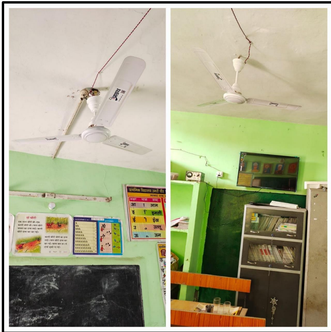
Pic 7: Fans installed in the classrooms of PS; Umri Peer donated by Pragrath

Fans were installed in the classrooms for a better ventilation and some relief from scorching heat to provide a better teaching learning environment. Pragrath hopes this step will help school in reducing the dropout rate and increase the retention rate of the students due to the reason of hot and humid environment specially during summer season.