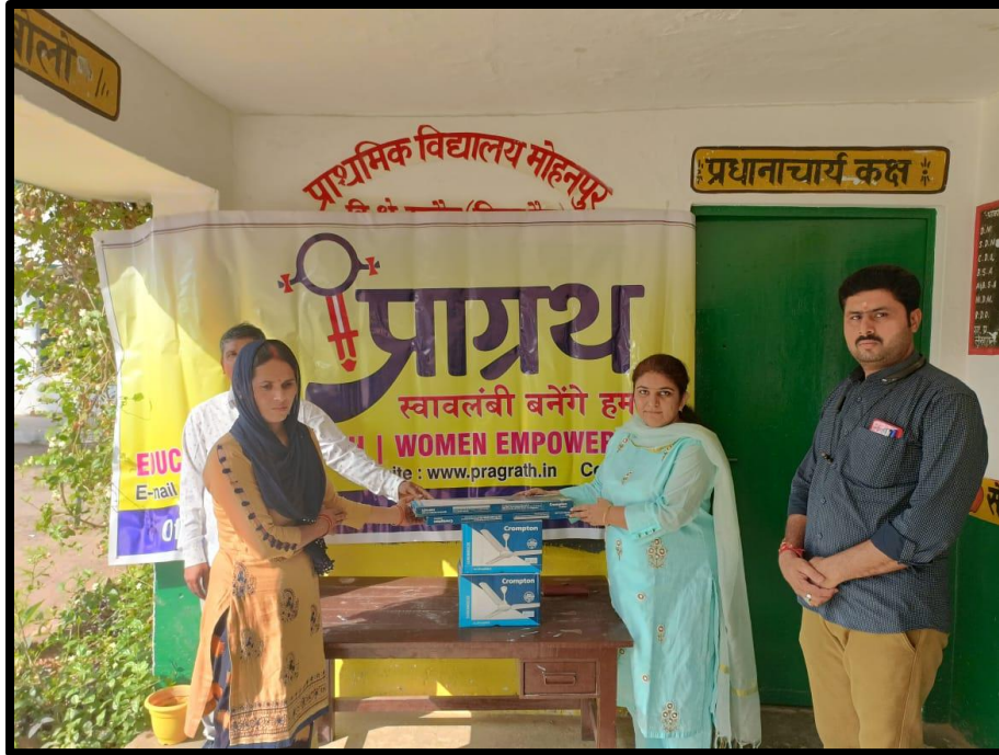
Pic. 3: Team Pragarth donating Ceiling fans to PS, Mohanpur

So, in order to provide a relief from the rising temperatures, Pragarth donated two ceiling fans i.e., one ceiling fan for each classroom to the Primary School, Mohanpur .