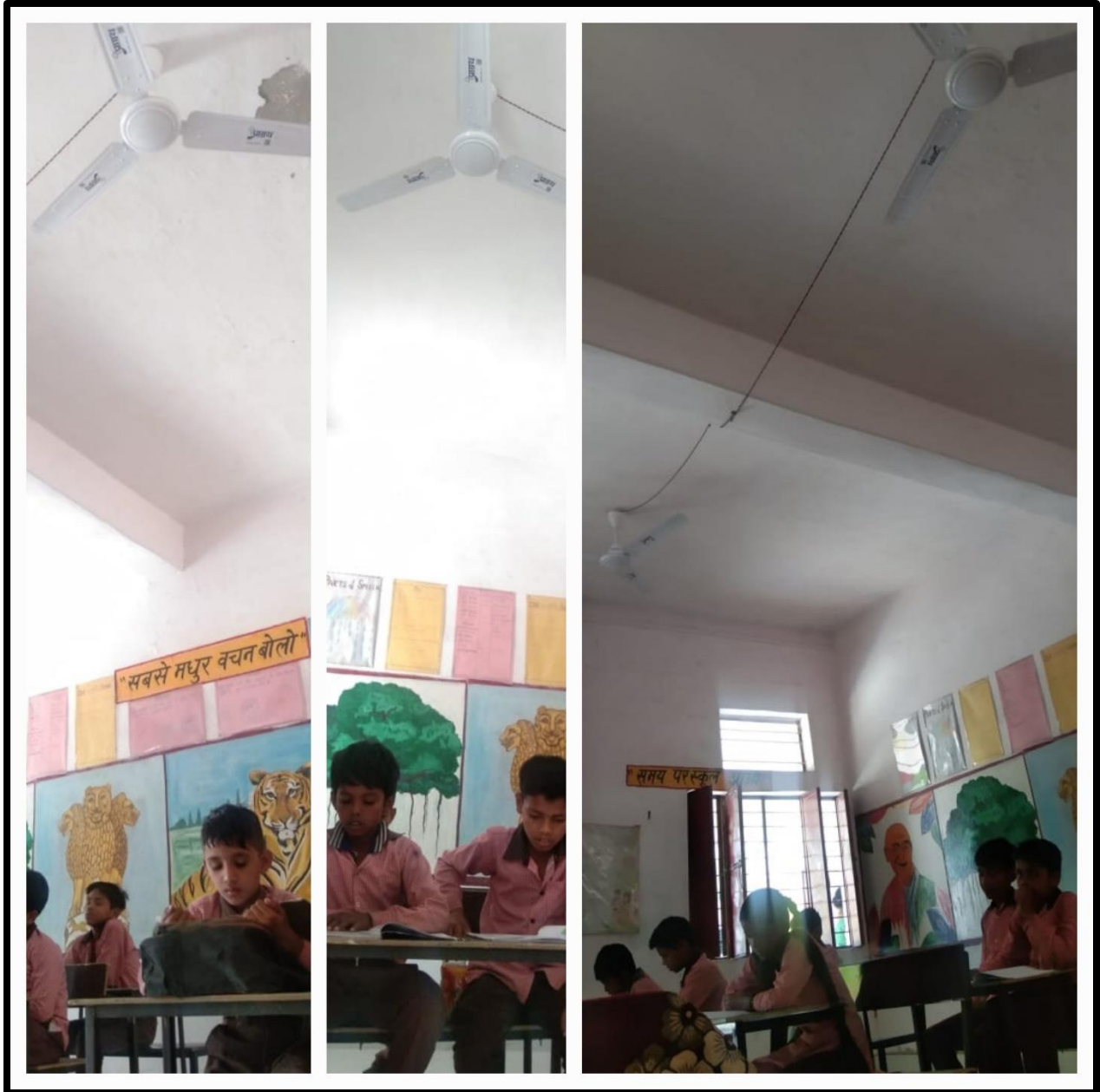
Pic 16: Fans installed in the classrooms of UPS; Rauniya donated by Pragrath