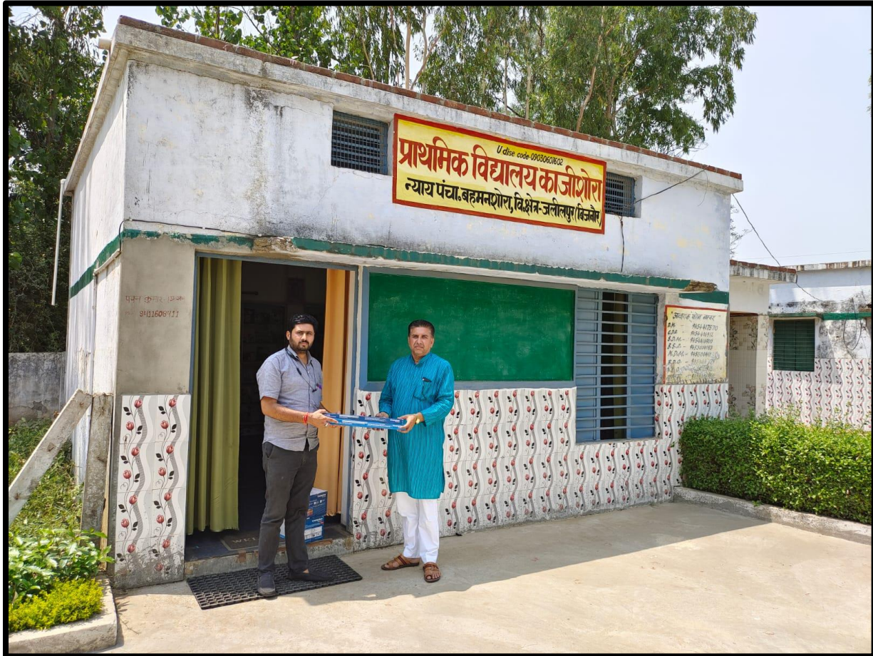
Pic. 12: Team Pragarth donating Ceiling fans to PS, Kazishora

Although each classroom has ceiling fan but as per the norms and for a better ventilation, the classrooms require two fans.