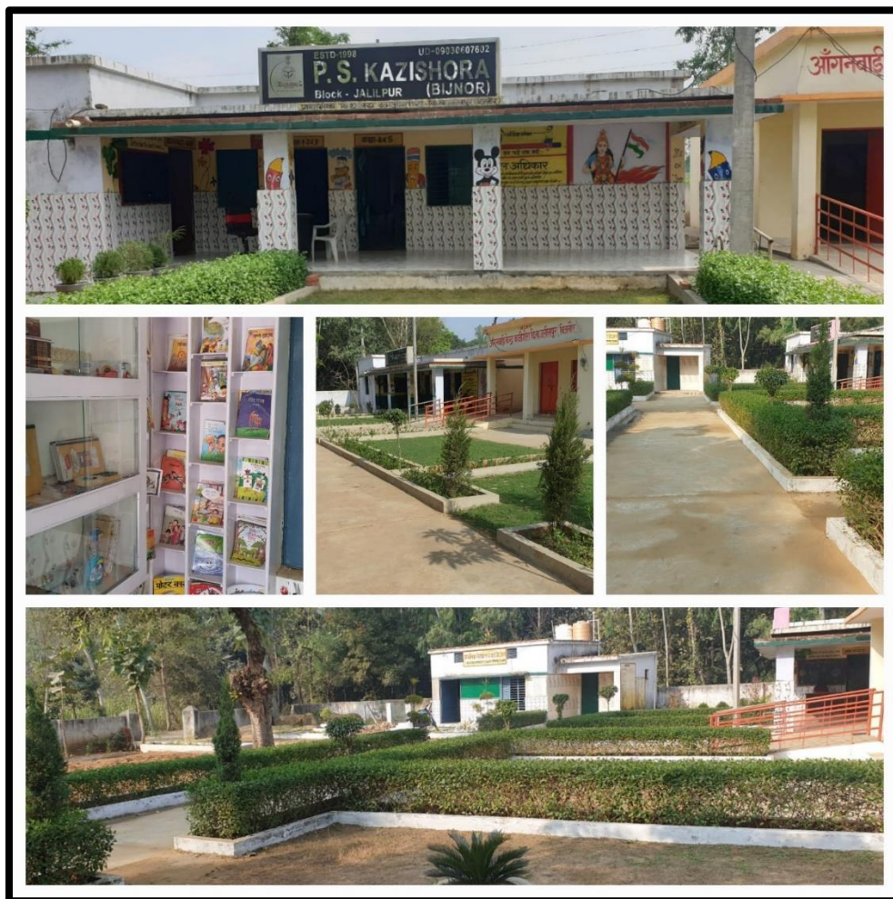
Pic 11: Primary School, Kazishora, Block Jalilpur, District Bijnor, UP

Primary School, Kazishora was located in the village Kazishora . The school was having almost all the basic facilities like toilets, drinking water, multiple handwashing unit etc. School runs with the help of Head Teacher and assistant teachers. Classrooms were well equipped with teaching learning materials to provide a better teaching learning environment to students for their better future.