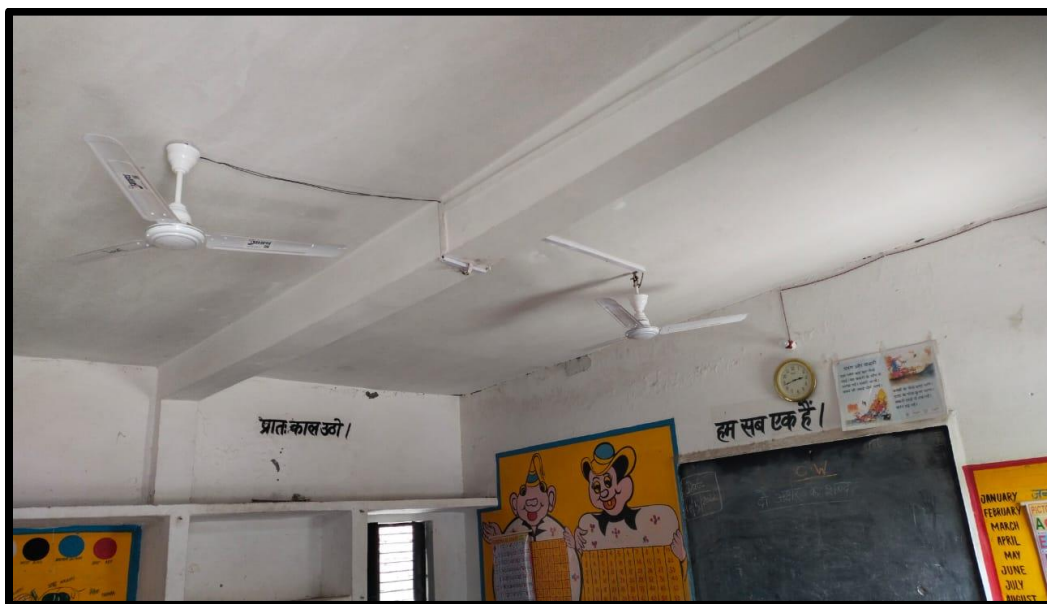
Pic 10: Fans installed in the classrooms of PS; Rauniya donated by Pragarth

So, in order to provide a relief from the rising temperatures, Pragarth donated two ceiling fans i.e., one ceiling fan for each classroom to the Primary School, Rauniya .