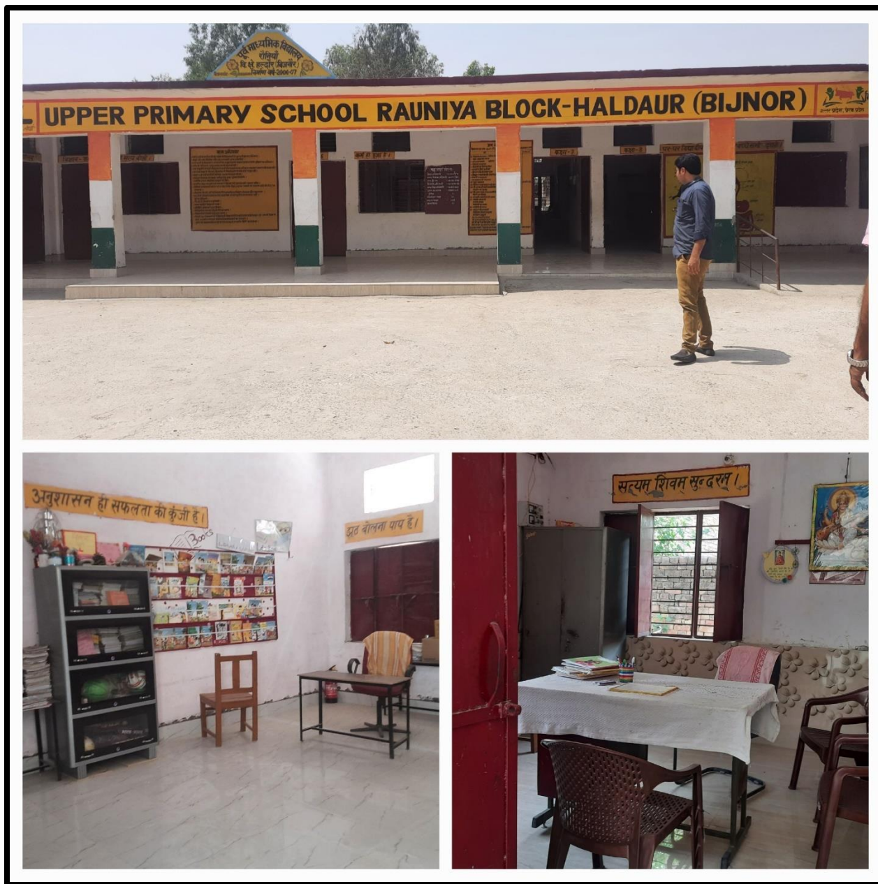
Pic 14: Upper Primary School, Rauniya, Block Haldaur, District Bijnor, UP

Classrooms were well equipped with teaching learning materials to provide a better teaching learning environment to students for their better future. Although each classroom has ceiling fan but as per the norms and a better ventilation, the classrooms require two fans.