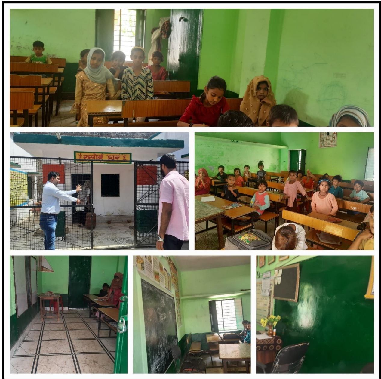
Pic 5: Primary School, Umri Peer , Block Haldaur , District Bijnor , UP

Primary School, Umri Peer was located in the midst of the village Umri Peer . The school was having almost all the basic facilities like toilets, drinking water, multiple handwashing unit etc.