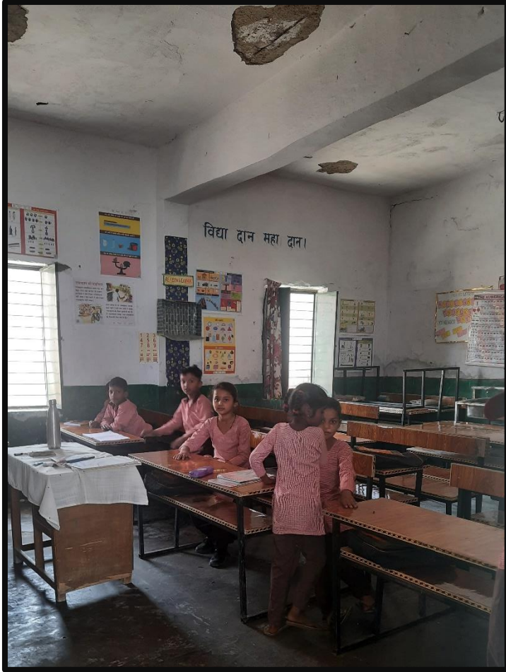
Pic1: Classroom in a Government Primary School, UP

The heatwave sweeping across the country has had a devastating effect to school going children, especially from government-run institutions, which sometimes lack amenities like fans, and other infrastructure items.