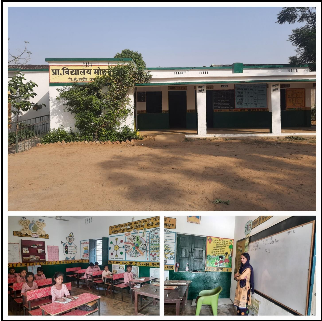
Pic 2: Primary School, Mohanpur, Block Haldaur, District Bijnor, UP

Classrooms were well equipped with teaching learning materials to provide a better teaching learning environment to students for their better future. Although each classroom has ceiling fan but as per the norms and a better ventilation, both the classrooms require two fans.