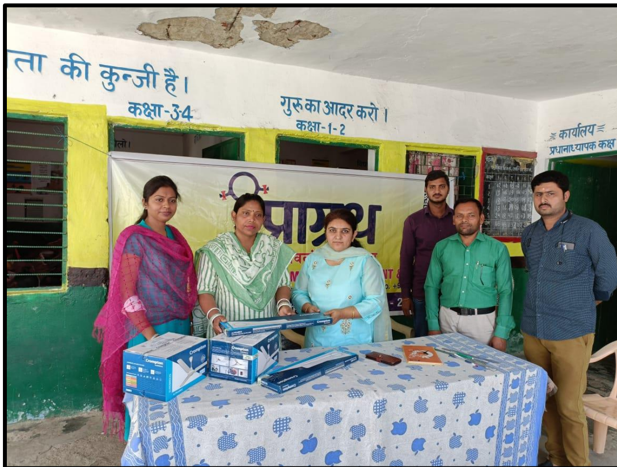
Pic. 18: Team Pragarth donating Ceiling fans to Composite School, Sisauna

So, in order to provide a relief from the rising temperatures, Pragarth donated two ceiling fans i.e., one ceiling fan for each classroom to the Composite School, Sisauna .