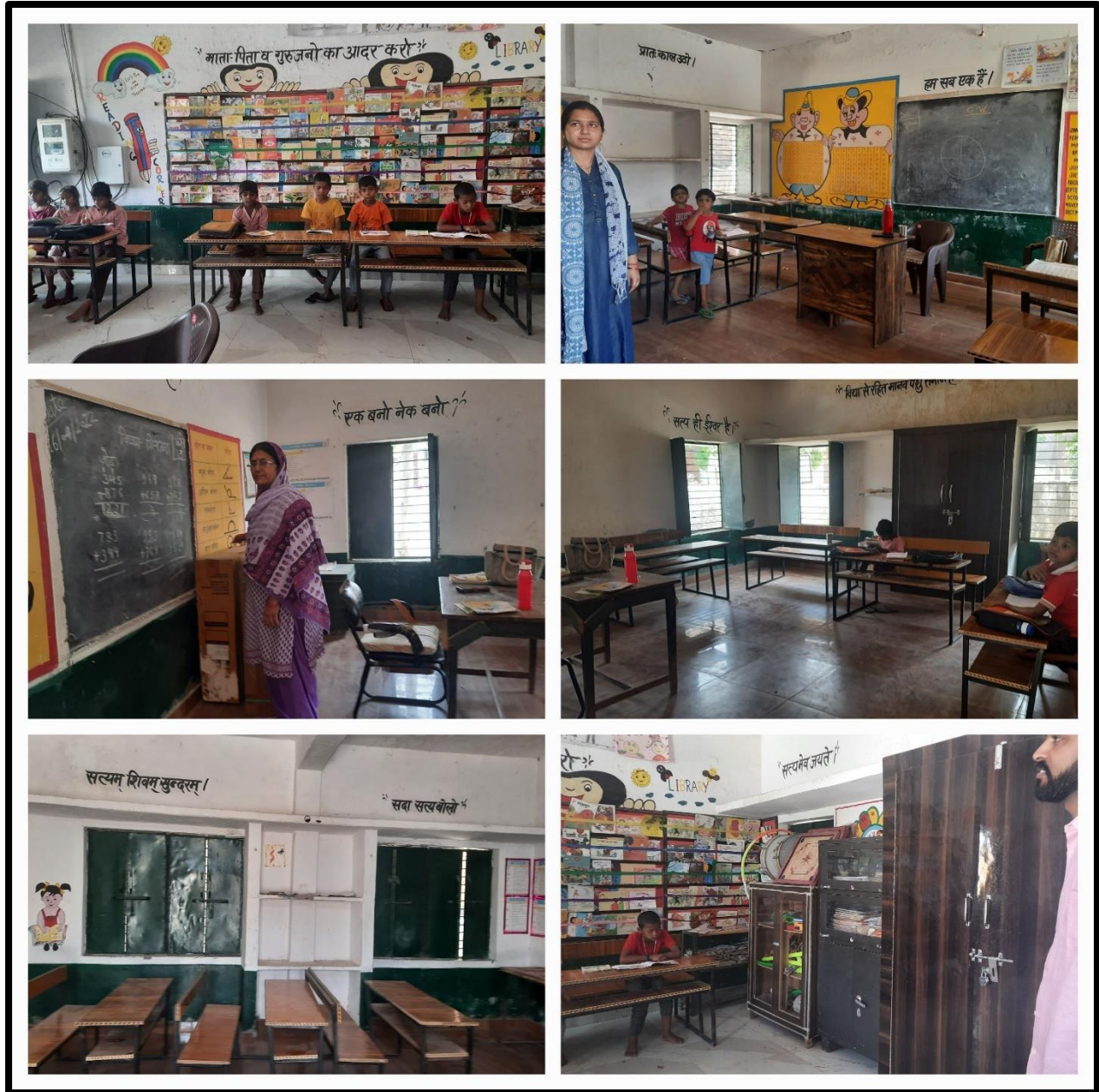
Pic 8: Primary School, Rauniya, Block Haldaur, District Bijnor, UP