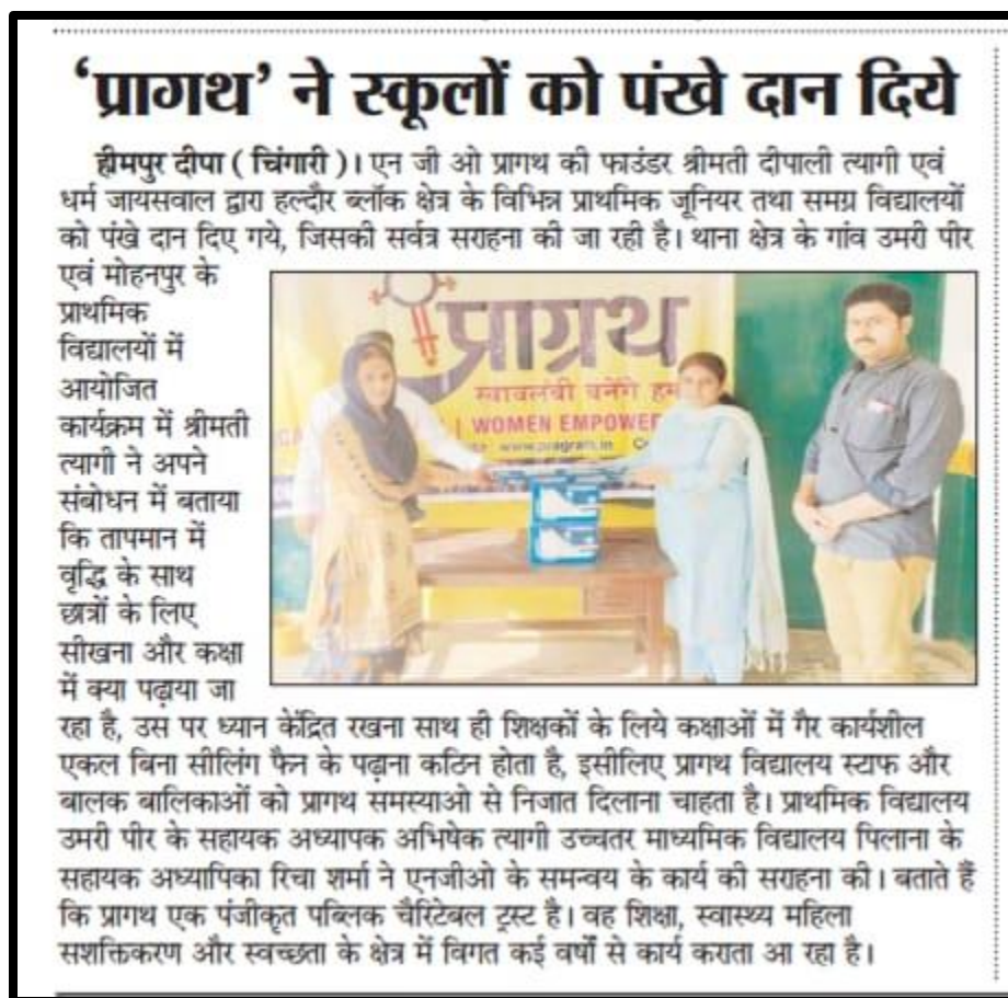
Pic 23: News published in evening newspaper “Chingari”

Efforts of Pragarth have been appreciated by the Local News Paper " Chingari " by publishing a news on 17 April, 2022, Haldaur Edition.